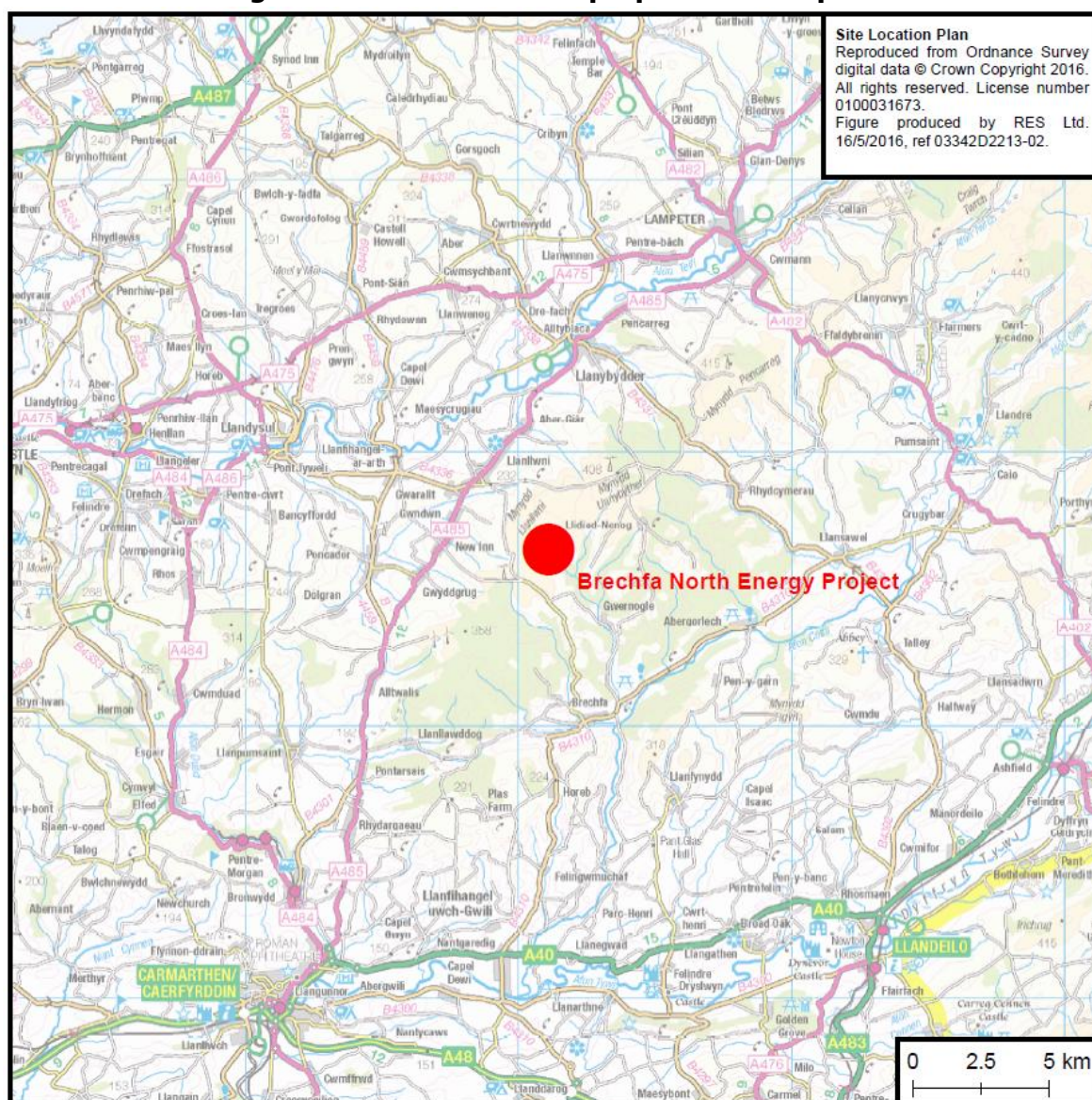
Figure 1 – Location of the proposed development

The site in question was subject to a planning application in 2010 for a 21-turbine wind farm known as Bryn Llywelyn. RES is considering the site afresh, with a view to designing a smaller development on private agricultural land that will optimise low cost and secure renewable energy generation while minimising local impacts.